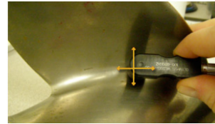
Example of scanning a propeller with eddy current testing

The second scan was performed using a NORTEC weld probe, chosen due to its contoured face.