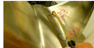
Fingertip probe can be used as well